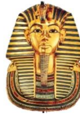
Tutankhamun's death mask.