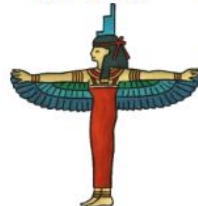
Isis Mother Goddess, Goddess of Protection and Healing